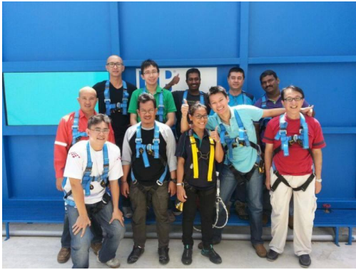
KBAX, WAH for Supervisor - 9 - 10 Oct 2013