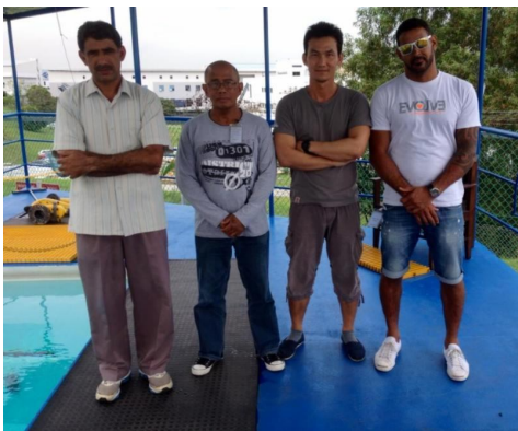
KBAT, DMTR, 11 - 15 Nov 2013