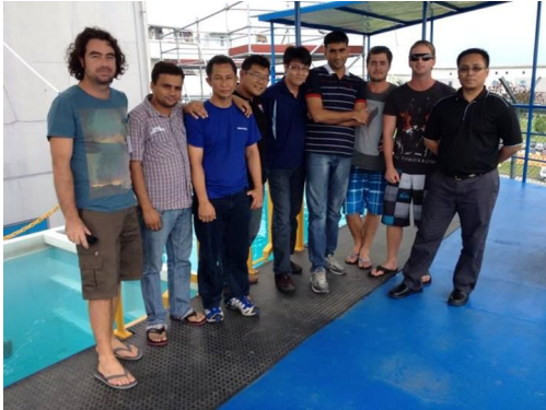
DMT, Singapore (30 Sep - 11 Oct 2013)

Click Here for the flyer or Contact us for more information.