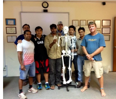
DMTR, Singapore (21 - 25 Oct 2013)