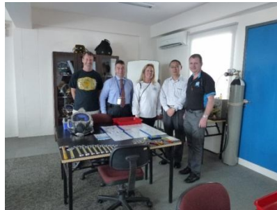
Kirby Morgan Team