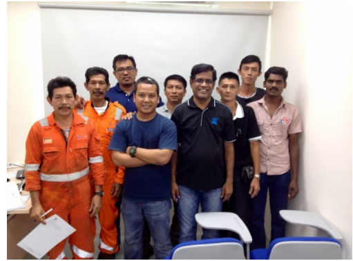
KBAX, WAH for workers - 14 Nov 2013