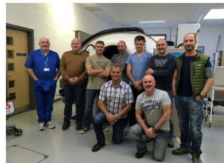
KBA UK, DMTR, 9-13 Dec 2013