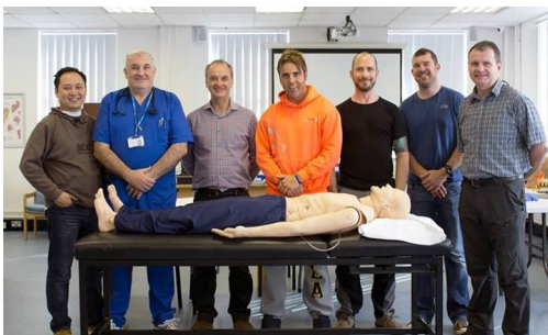
KBA Europe, DMTR, 14 - 18 Oct 2013