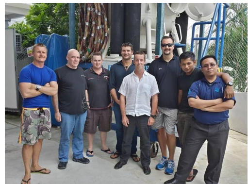
KBAT, DMTR, 2-6 Dec 2013