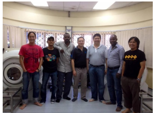
DMT, Malaysia (18 - 29 May 2014)