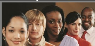
Training - Safety, Diving, First Aid, Access