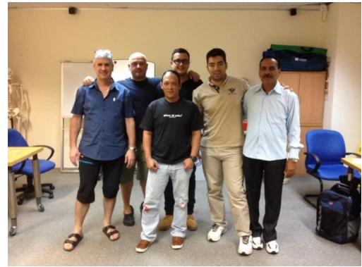
KBAT, DMTR, 23-27 June 2014