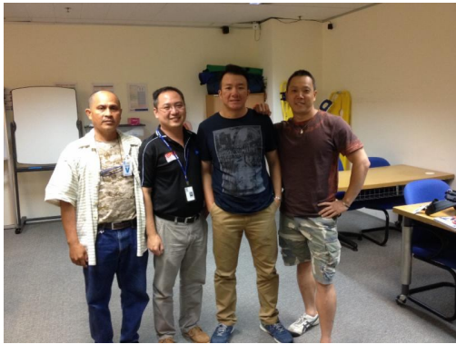
KBA Europe, DMTR, 5-9 May 2014