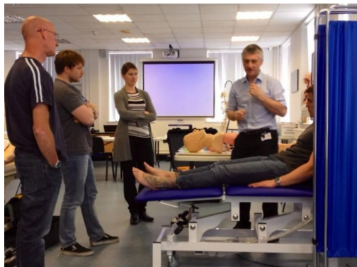
DMT, Chichester (14 - 25 April 2014)