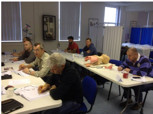
KBA Europe, DMTR, 10-14 Feb 2014