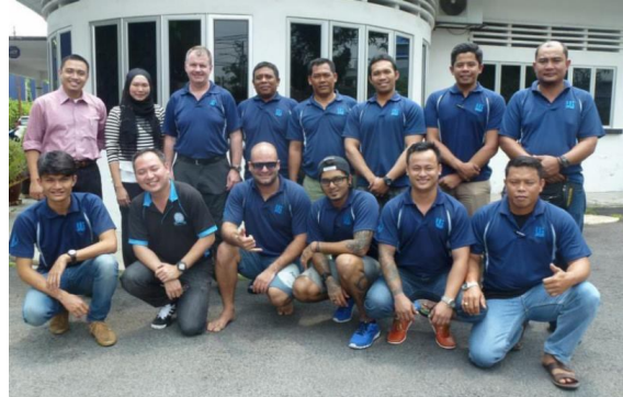
DMT, Malaysia (17 - 28 Feb 2014)