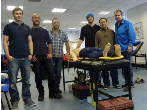
DMT, Chichester (13 - 24 Jan 2014)