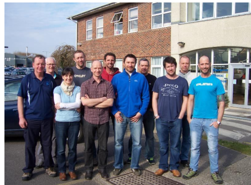
KBA Europe, DMTR, 17-21 Mar 2014