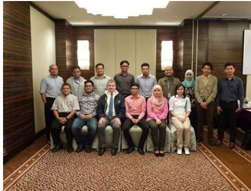
Diving Safety Awareness Workshop, PETRONAS CARIGALI, 17 - 19 Mar 2015

KBAT conducted a ROV Awareness Workshop for the personnel of PETRONAS Carigali / Petroliam Nasional Berhad (PETRONAS) in Kuala Lumpur, Malaysia. The two day training was an interesting dialogue and lessons learnt and shared.