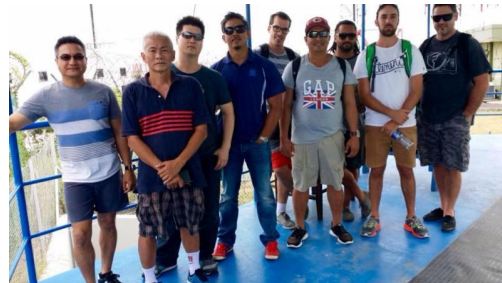
DMT, Singapore (2 - 13 Feb 2015)