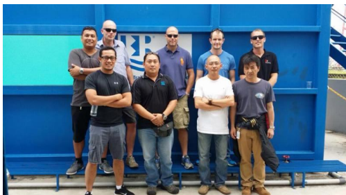
DMTR, Singapore (26 - 30 Jan 2015)