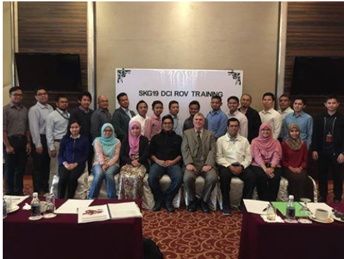
ROV Awareness Workshop, PETRONAS CARIGALI, 10-11 Mar 2015