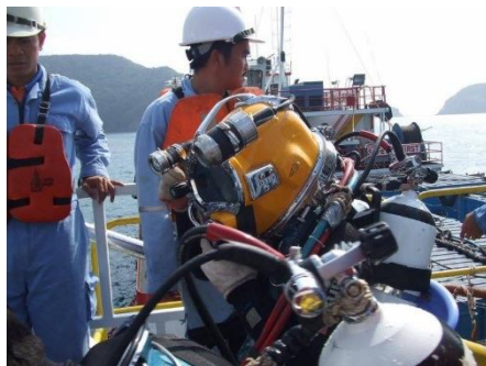
Safety check prior to dive

In February, KBA completed the assessment of 24 experienced divers who work for PVMTC based in Vietnam. The assessment period was over 20 days and consisted of the full range and