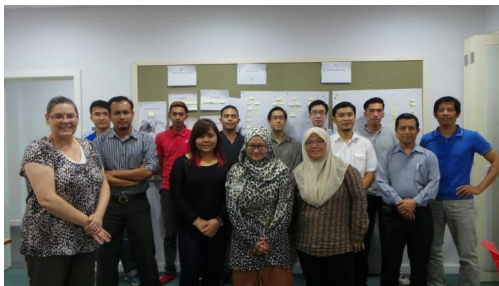
26 - 27 Jan in Brunei