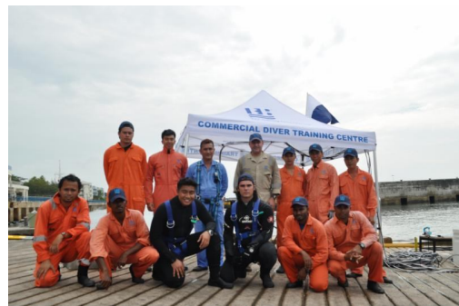
Group Photo on CSCUBA course in January 2015