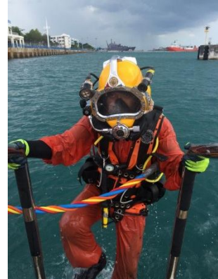
Emerging from the water