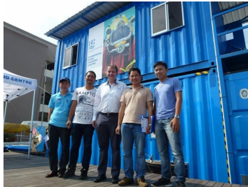
Group Photo at the New Diver Training Centre.

Delegates from Petrovietnam Manpower Training College (PVMTTC) Vietnam have attended the popular Diving System Assurance Auditor course on the 10 - 13 Feb 2015 in Singapore. They were one of the pioneer batch to visit the new Commercial Diver Training Centre in SAF Yacht Club to conduct an onsite audit of the dive system.