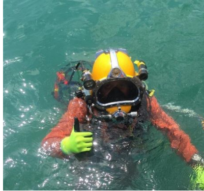
Enjoying the coolness in the water?

The next training schedule will be released soon. Contact us for more information.