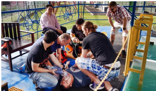
DMT, Singapore (12 - 23 Jan 2015)

Refreshers are scheduled in Singapore on the 18 - 22 May or 08 - 12 June; Chichester, UK on 13 - 17 April 2015. Click Here for the flyer.