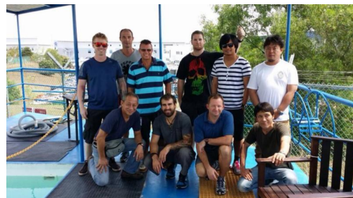
DMTR, Singapore (23 - 27 Feb 2015)