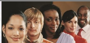
Training - Safety, Diving, First Aid, Access