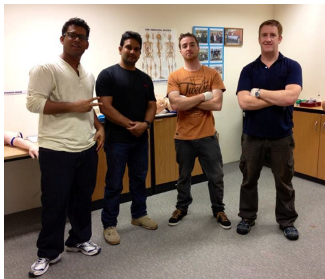
DMTR, Singapore (29Jul-2Aug 2013)