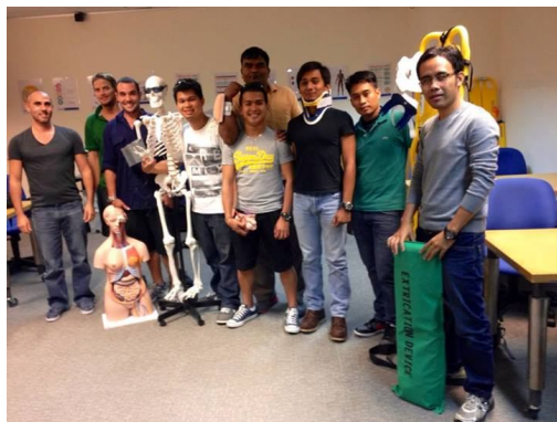
DMT, Singapore (8 - 19 Jul 2013).

Click Here for the flyer or Contact us for more information.