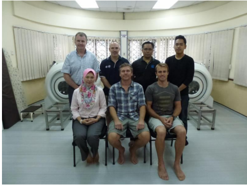
DMTR, Kuala Lumpur (26 - 30 Aug 2013)