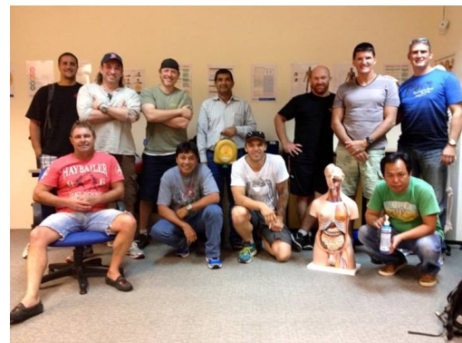
DMTR, Singapore (24 - 28 Jun 2013)