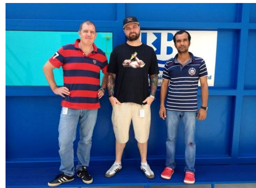
DMTR, Singapore (19 - 23 Aug 2013)