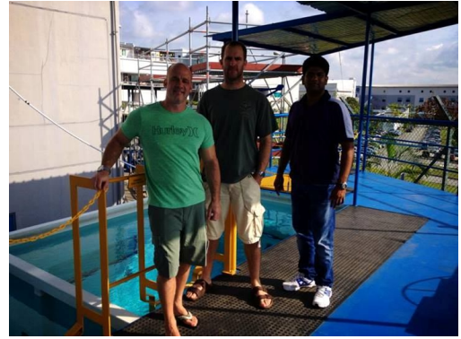
DMTR, Singapore (16 - 20 Sep 2013)