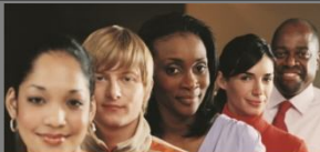
Training - Safety, Diving, First Aid, Access