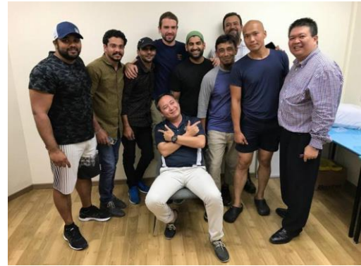
Refresher in Singapore on 3 -7 Jul