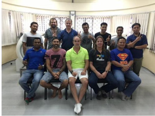
(Refresher in Malaysia on 22-26 May)

The next DMT full course will be held in Singapore on 14 to 25 Aug whilst the next Refresher training in Singapore on 17 to 21 Jul or 04 to 08 Sep 2017; Malaysia - Kuala Lumpur on 10 to 14 Jul 2017. Click here for the flyer.