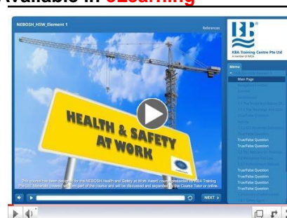
NEBOSH Health & Safety at Work Qualification - eLearning [What's in it]

Click here for the flyer or Ask us for more information.