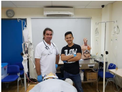
DMT in Singapore on 12 - 23 Jun