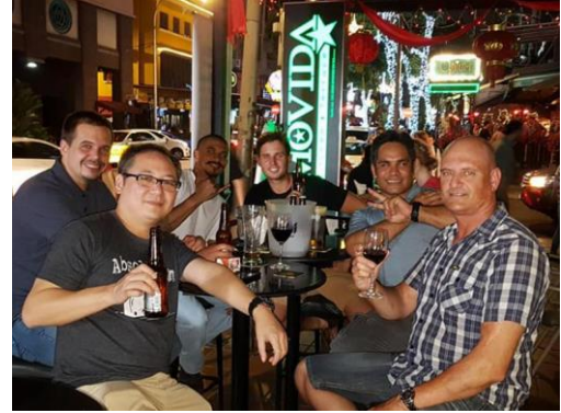
DMT in Malaysia on 5 - 16 Mar 2018