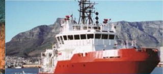
KBA Europe — Consultancy & Training