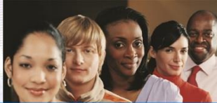
Training - Safety, Diving, First Aid, Access