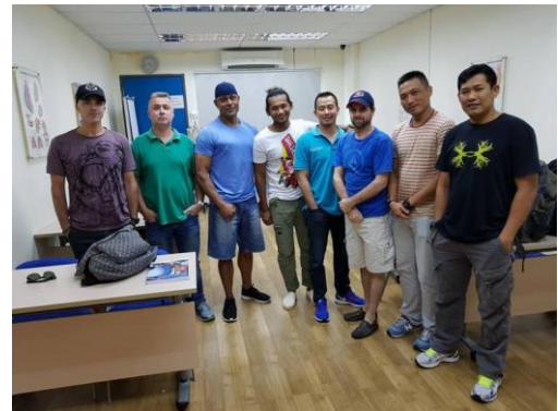
Refresher in Singapore on 5 - 9 Feb 2018