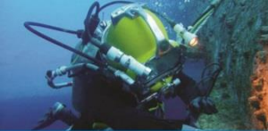
Marine Services — Commercial Diving Services