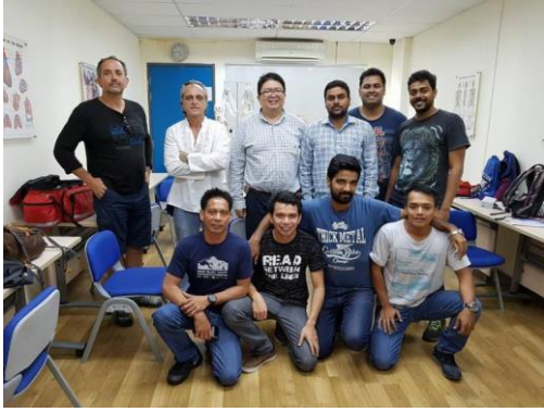
DMT in Singapore on 08 - 19 Jan 2018