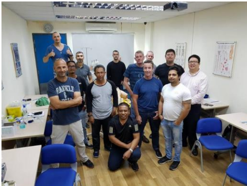
Refresher in Singapore on 22 - 26 Jan 2018